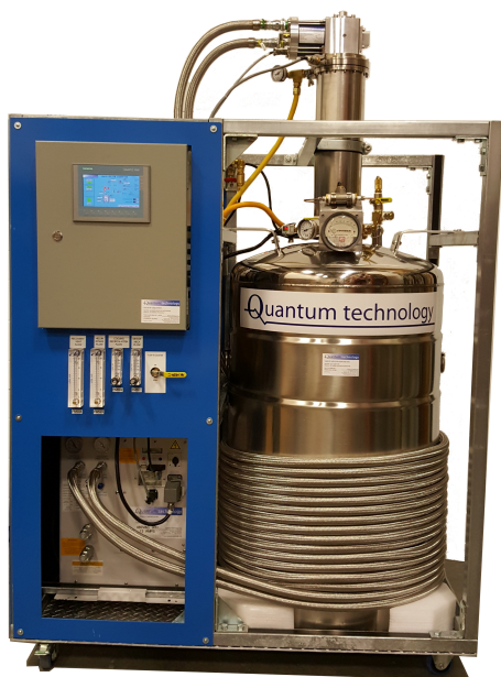
Quantum mobile liquefier